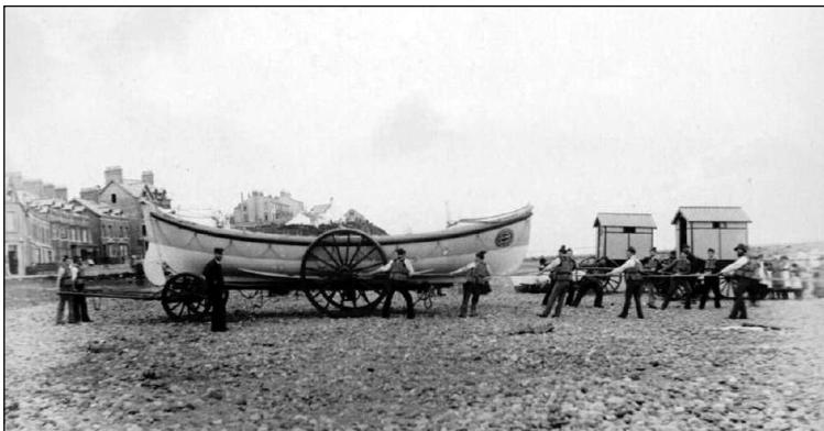
Seascale lifeboat, circa 1880.