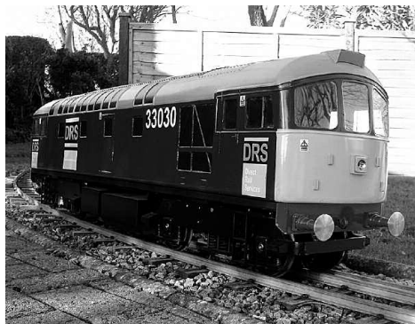
5" gauge (1/11 scale) Class 33 Diesel Loco in livery as used for Sellafield to Drigg Traffic. The model is powered by 2 x 12V batteries driving two wheelchair motors.

The first time I saw a miniature steam locomotive in action was in the garden shed of my Dad's Uncle Fred. He lived on the outskirts of London and we went there for a holiday as a family. The locomotive had never run on a track but was set up on rollers, the smoke being piped from the chimney to the outside world. The whole machine was no longer 20" (½-metre) but it looked, smelled and behaved like the full size ones that were a part of our everyday life in the 1950s and '60s. It danced on the rollers as its